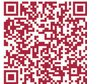
HOW TO GET TO TERAMO MORE INFORMATIONS

FOR A LIST OF THE HOTELS AND THE RESTAURANTS www.teramoculturale.it