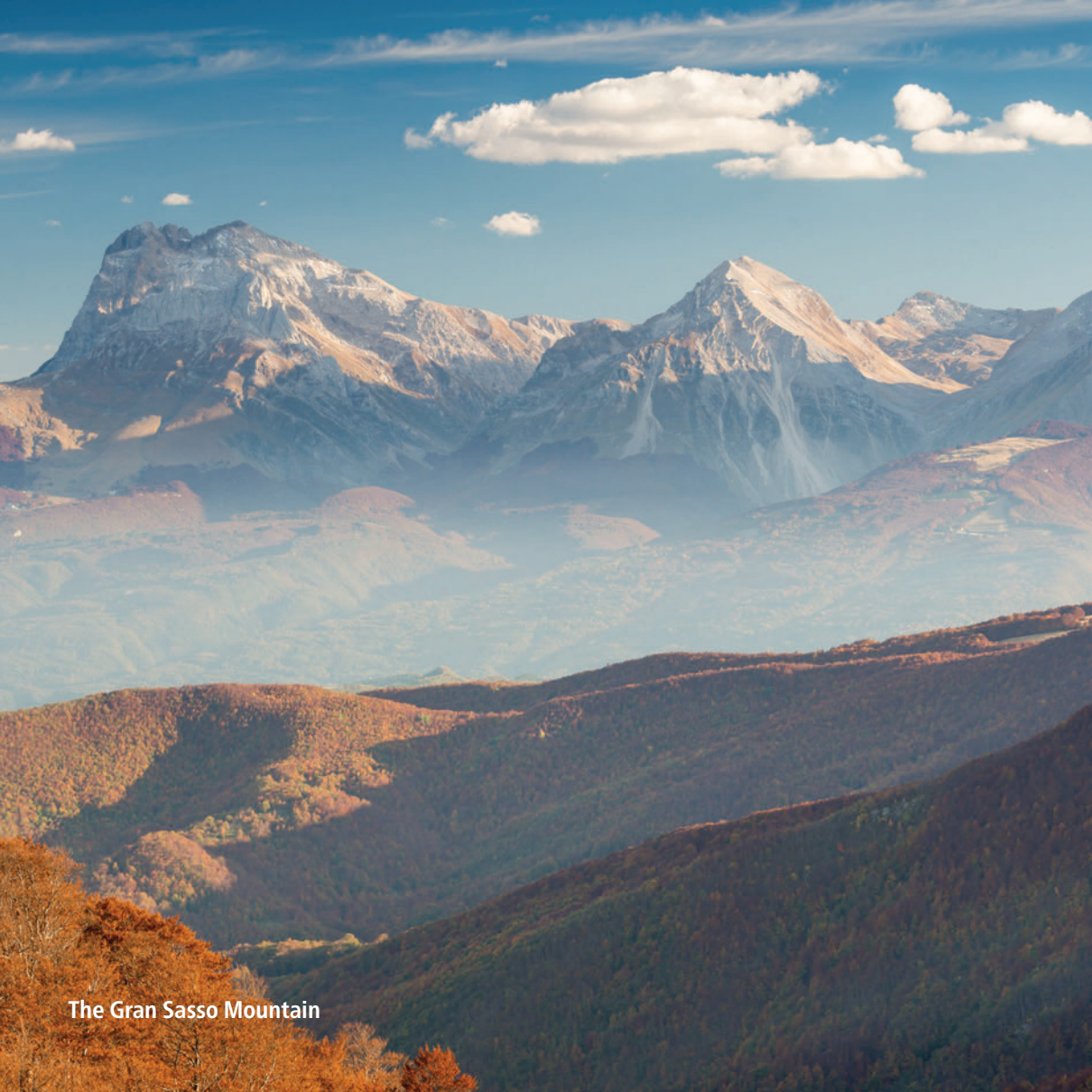
The Gran Sasso Mountain