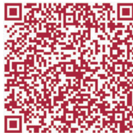
MUSIC AND THEATRE