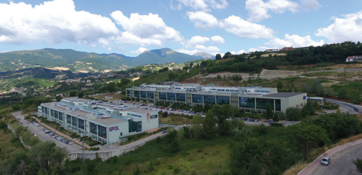
Above the Aurelio Saliceti Campus - Below the Ruggero Bortolami Campus