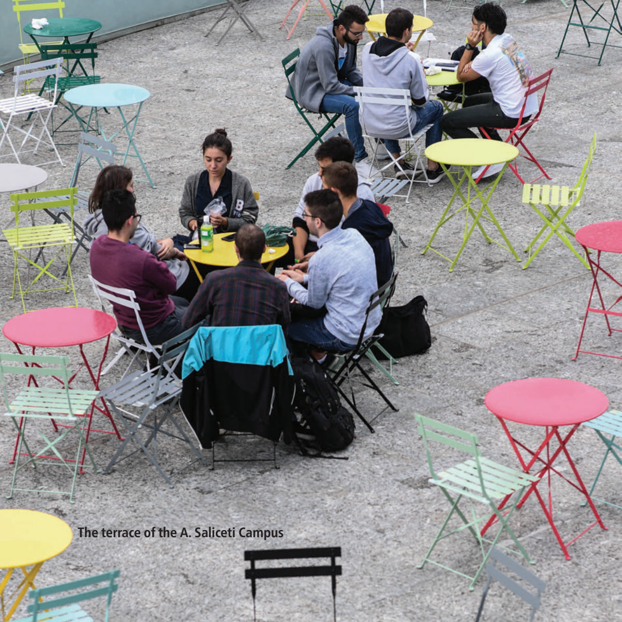
The terrace of the A. Saliceti Campus