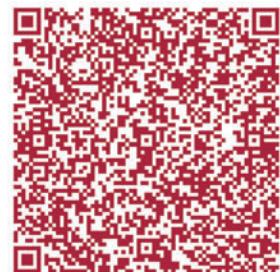
COVID 19 MEASURES